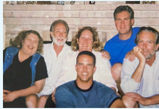
...and all grown up!