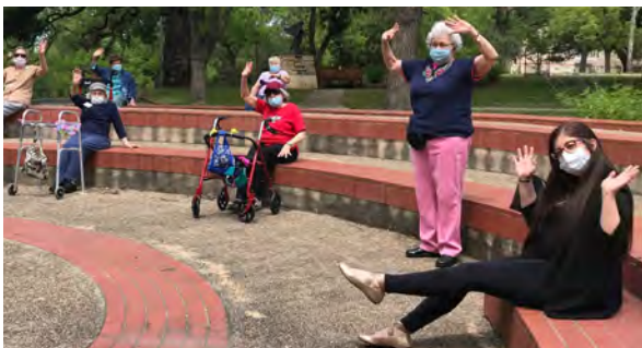
TVIW residents and staff at the beginning of the pandemic in Spring 2020

A year ago, we were only three weeks into Lent when the pandemic took on very real implications in our lives at The Village. The sacrifices of the remaining weeks were not the ones individuals had chosen; they became the sacrifices imposed by Public Health regulations. Rather than giving up desserts, we gave up eating together and praying together in person. One of the things I look forward to in 2021 is a more full celebration of the rituals of Holy Week, which we could not have last year.