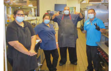
Bistro staff on New Year's Eve

I look forward to gathering our staff for Employee Appreciation celebrations. I miss the opportunity to thank the dietary workers, the housekeepers, the maintenance workers, the nurses, etc. for the many ways they bring the love of God to our residents and their co-workers. I miss the chance to encourage them to carry on with respect, compassion, honesty and collaboration to promote the dignity of each person. I miss the opportunity to bless their hands and pray with them in person.