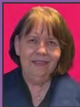
Elizabeth Granatos Assisted Living