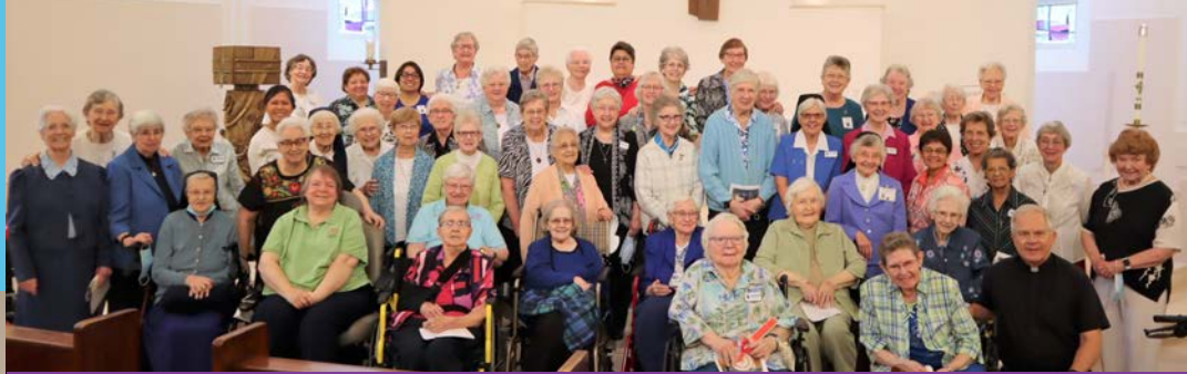
CCVI Sisters renew their vows and celebrate Mass together during the Feast of the Assumption (August 15) in St. Joseph's Chapel