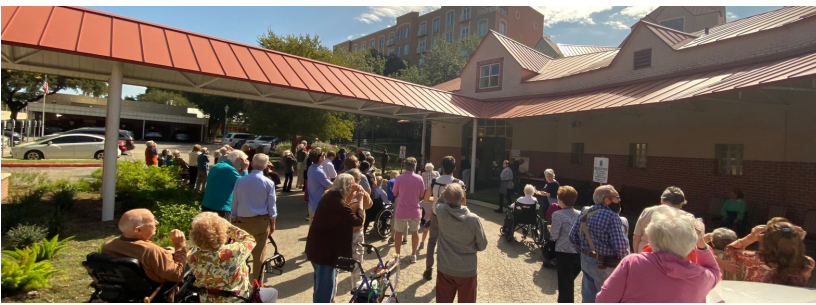
Residents, family, and staff gather to watch the Annular Eclipse on October 14, 2023