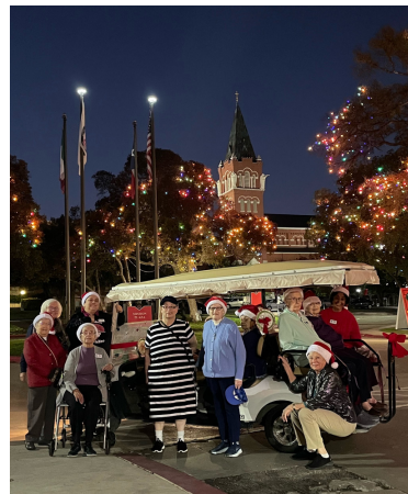
Residents and staff visit UIW's light display