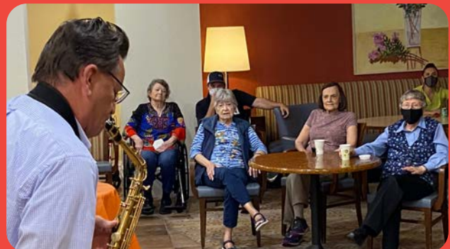
Independent Living residents listen to a Musical Monday performance