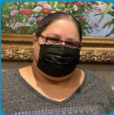
Linda Rios Assisted Living