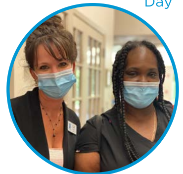
Employee Appreciation Day