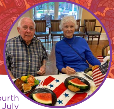
Fourth of July

The Catholic Christian tradition is rich in ritual and the use of symbols. When we come to worship God through the celebration of the Mass, we are recalling the Last Supper, the death of Jesus on the cross and his glorious resurrection on the third day. Our recalling is not just a remembering of past events, but an entering into those realities by the power of God’s grace.