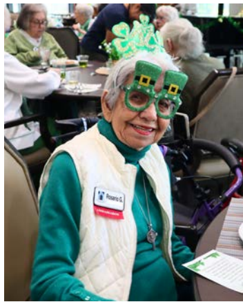
Rosario celebrates St. Patrick's Day