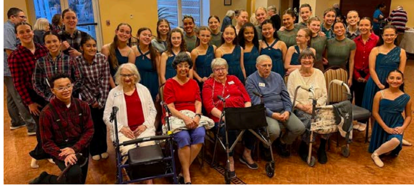
Residents enjoy a performance by student dancers from the Ballet Conservatory of South Texas