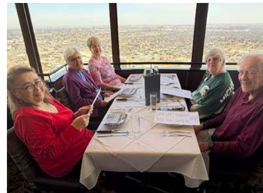
Residents enjoy lunch at the top of the Tower of Americas