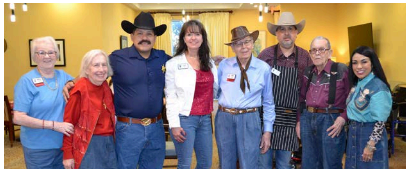
Residents and staff dress up for Cowboy Breakfast